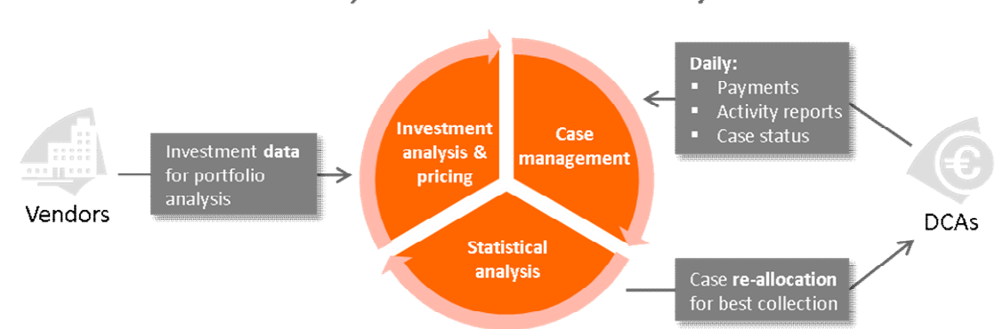
FUSION system overview with main data flows

The integration of FUSION with collection partners and sellers via daily upload files enables the Group to have full operating control over its assets and enhances both collections and pricing of new acquisitions. The diagram below illustrates an overview of the main data flows.